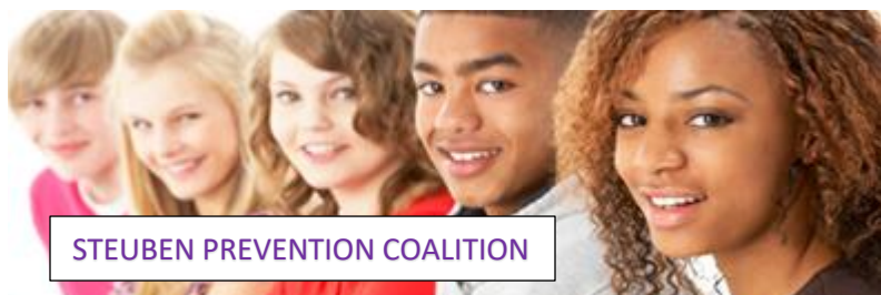
STEUBEN PREVENTION COALITION